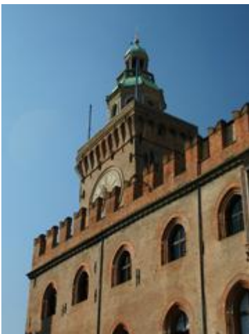
The University of Bologna.

Science teaching in Italian universities could be crippled if tens of thousands of junior staff make good on threats to strike later this year. The 'ricercatori' (researchers) are protesting harsh university budget cuts and a looming reform bill, which threaten their futures.