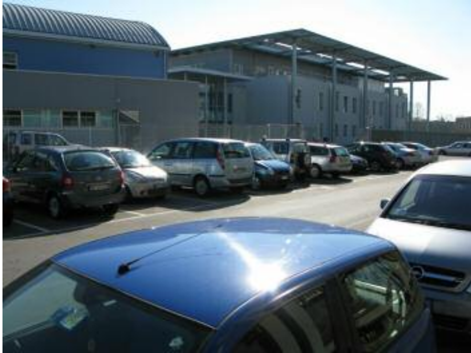
Sesini building: our offices are in this building