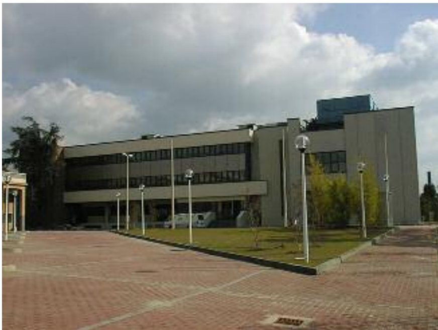
Outside view of the wind tunnel