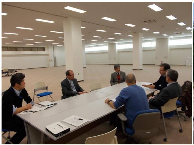
Discussion in the REC Room at Rokkasho site