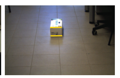
3.4: Actual height is 8.1 cm, estimated 3.5: Actual height is 29.6 cm, estimated 3.6: Actual height is 12.3 cm, estimated height is 8 cm, and \beta = -10^{\circ} . height is 29.1 cm, and \beta = -15^{\circ} . height is 11.4 cm, and \beta = -20^{\circ} .