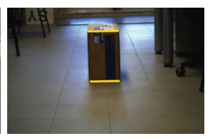
3.1: Actual height of the object is 36 cm, 3.2: Actual height is 29.6 cm, estimated 3.3: Actual height is 36 cm, estimated estimated height is 36.3 cm, and \beta = 0^{\circ} . height is 29.9 cm, and \beta = -7^{\circ} . height is 35.7 cm, and \beta = -10^{\circ} .