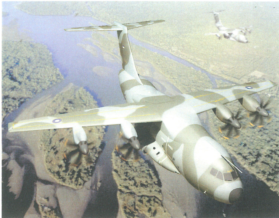
Artist's impression of the turboprop-powered Airbus Military A400M

PROGRAMME: Original FIMA programme replaced April 1989 by five-nation industry MoU to develop four-turboprop, new technology transport to replace C-130 Hercules and C.160 Transall; Independent European Programme Group (IEPG) defined Outline European Staff Target (OEST) during 1991; initial studies undertaken by Euroflag organisation, which name reflected working designation Future Large Aircraft (FLA). Western European Union report in third quarter of 1991 concluded Euroflag FLA should form core of future European military transport capability to support Rapid Reaction Corps; national armament directors of Belgium, France, Germany, Italy, Portugal, Spain and Turkey affirmed support for 12 month prefeasibility study completed by Euroflag in late 1992; UK MoD declined involvement, but retained observer status; UK participation privately maintained by BAe and Shorts (10 per cent of BAe work); European Staff Target and intergovernmental MoU signed by seven nations in 1993; full feasibility programme officially started October 1993, by which time cargo hold width and height increased from original 3.66 m (12 ft 0 in) and 3.55 m (11 ft 7 7/8 in), respectively; study finished May 1995 and submitted to