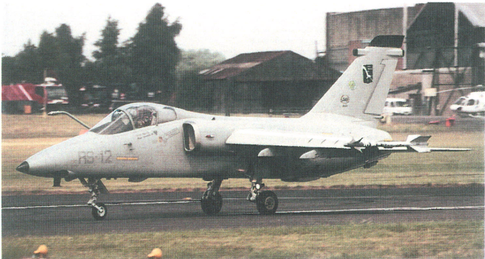
AMX Ghibli CSX7158, an upgrade trials aircraft of the Italian Air Force's Reparto Sperimentale di Volo trials unit

Italian single-seater production temporarily halted following delivery on 1 February 1993 of 72nd aircraft