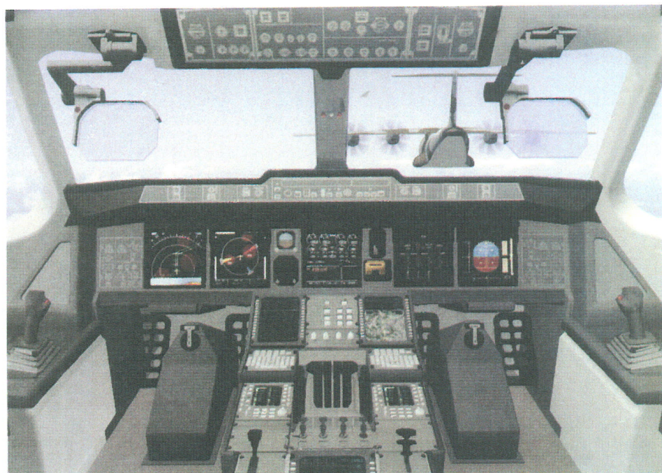
Flight deck of the Airbus Military A400M, created by computer imagery