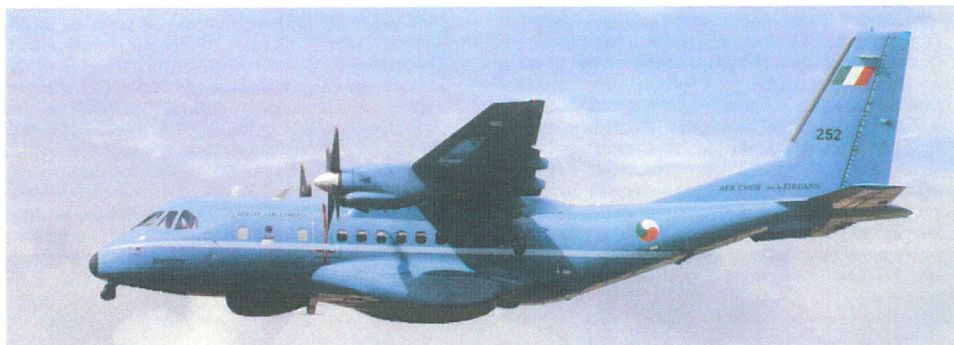
Maritime surveillance CN-235 MP Persuader of the Irish Air Corps